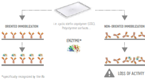
ENZYMATIC ACTIVITY AFTER BINDING TO ANTIBODY